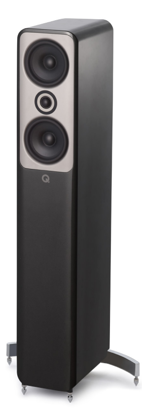
Concept 50 Floorstanding speaker £1,999