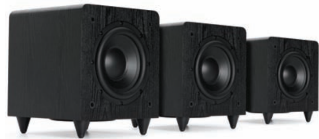
Sunfire's Dynamic Series includes the SDS12, SDS10 and ultra-compact SDS8.