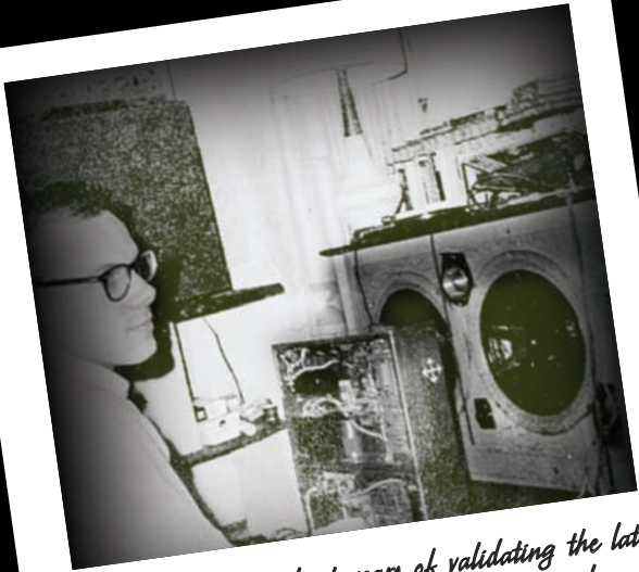
1965—Carver's earliest years of validating the latest audio technologies and looking for unconventional approaches to amplifier design.