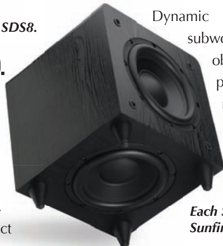
Each SDS Subwoofer features two, custom Sunfire drivers for the most bass in its class.

The latest expression of Sunfire's vision is called the Sunfire Dynamic Series. True to their name, these three all-new subwoofers are both vibrant and forceful, delivering Sunfire's acclaimed blend of powerful bass delivered with both high-resolution and high output. How much bass? Up to 600 Watts of dependable, cool-running Sunfire bass wrapped in the smallest cabinet of any product