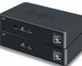
The SDS 2.4Ghz Wireless Transmitter (model WiTX) and Wireless Receiver (model RiTX). Experience no audio dropout up to 40 feet from the source.

Now you can place your SDS subwoofer wherever it will perform its best without the nightmare of drilling, snaking or dragging wires through your living area. Sunfire's 2.4Ghz wireless kit is specifically designed and tuned for subwoofer applications. All you need is a power outlet near the sub and you're ready for optimal plug-and-play bass with no visual noise attached.