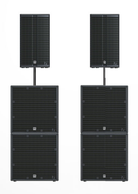
Power setup: 2 x L7 112 FA, 4 x L7 118 Sub A