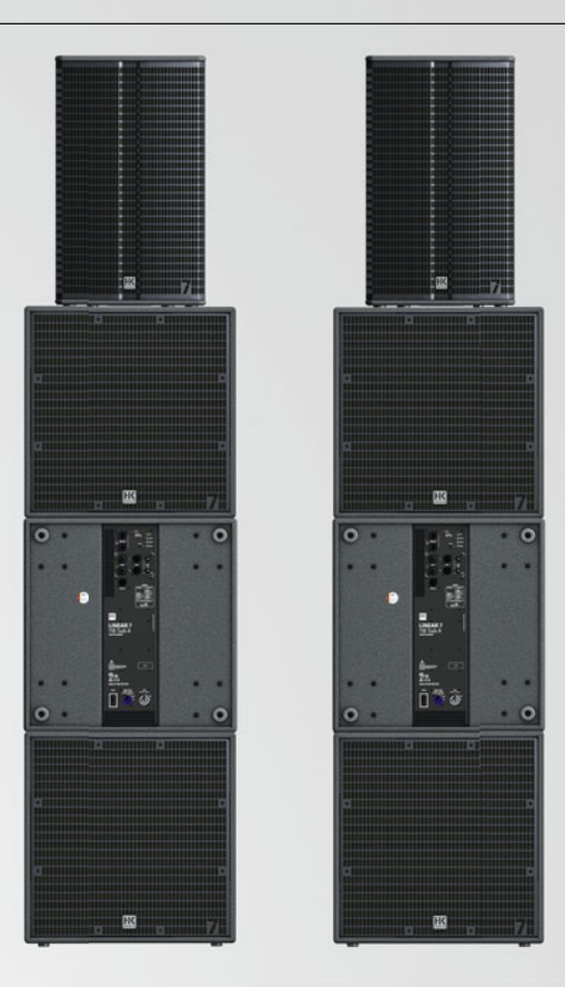
Cardioid setup 2:1