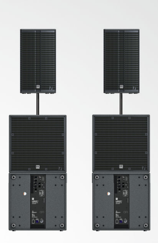
Cardioid setup 1:1