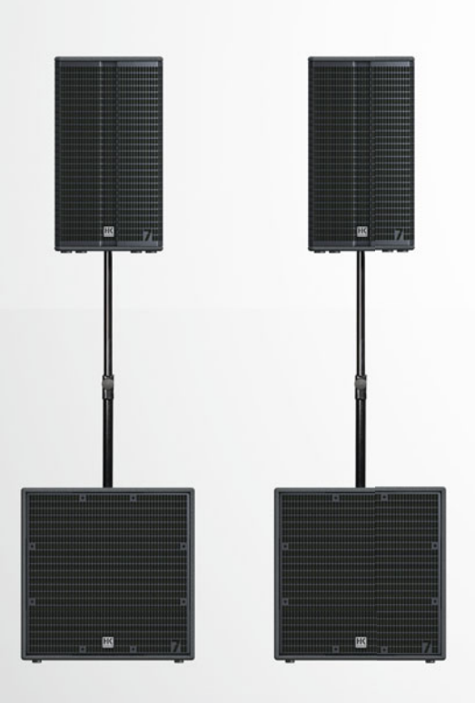
Club setup: 2 x L7 112 FA, 2 x L7 118 Sub A