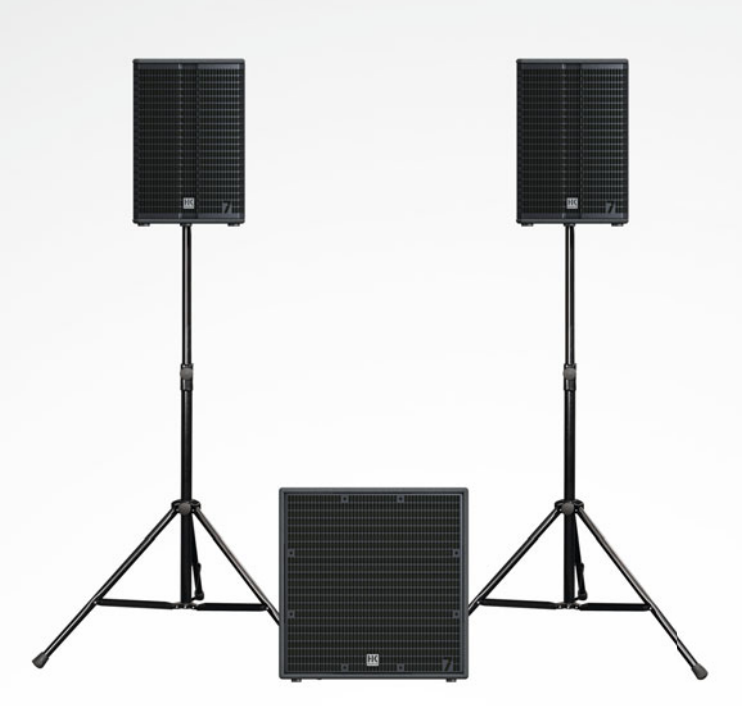
2.1 setup: 2 x L7 110 XA, 1 x L7 118 Sub A