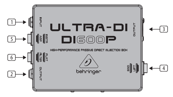
Fig. 1: Top view