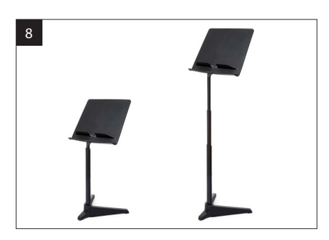
Specification may change without notice.