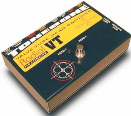
Headbone VT - Order # R800 7082 Headbone TS - Order # R800 7083 Headbone SS - Order # R800 7084

The Headbone is a guitar amplifier switcher that allows two heads to share one speaker cabinet. The Headbone lets you toggle from one head to another without pops, clicks, hum or added noise.