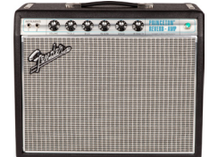
68 CUSTOM PRINCETON REVERB

Designed to sound as close to the original as possible, the '65 Reissues are assembled in Corona, California and feature Jensen speakers (One C12K for the Deluxe and two C12Ks for the Twin, four P10Rs for the Super and one C10R for the Princeton), Schumacher transformers, traditional tremolo and tube-driven reverb to create that classic, "Blackface" sound so many players desire.