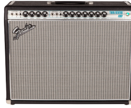
68 CUSTOM TWIN REVERB