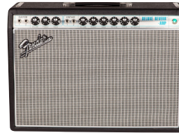
68 CUSTOM DELUXE REVERB