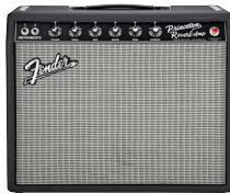
'65 PRINCETON REVERB