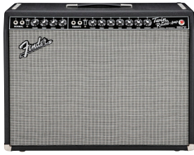
'65 TWIN REVERB