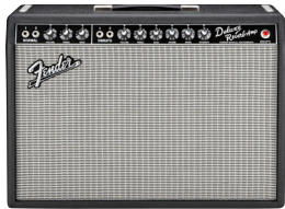
'65 DELUXE REVERB