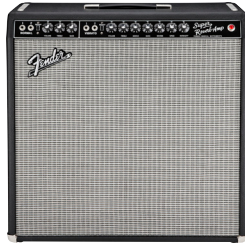
'65 SUPER REVERB